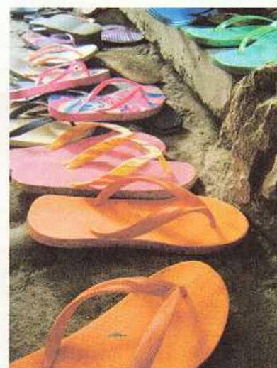
Endless lines. Slippers serve as the humble vehicle of members religiously attending the San Antonio I Center meeting, Bajada Unit, CARD Bank Davao.