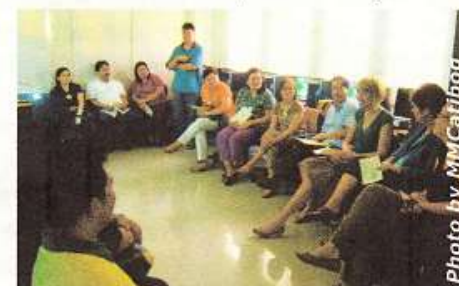
CARD MRI Executives and Oikocredit representatives share opinion on CMDI E-Learning facility.

With CMDI venturing on a distance learning facility, CARD MRI can bring Microfinance and Education to a wider scope and at a higher level.