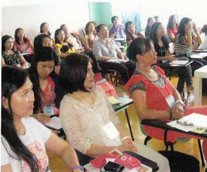
Hongk Kong OFWs attend the Financial Literacy training in Hong Kong