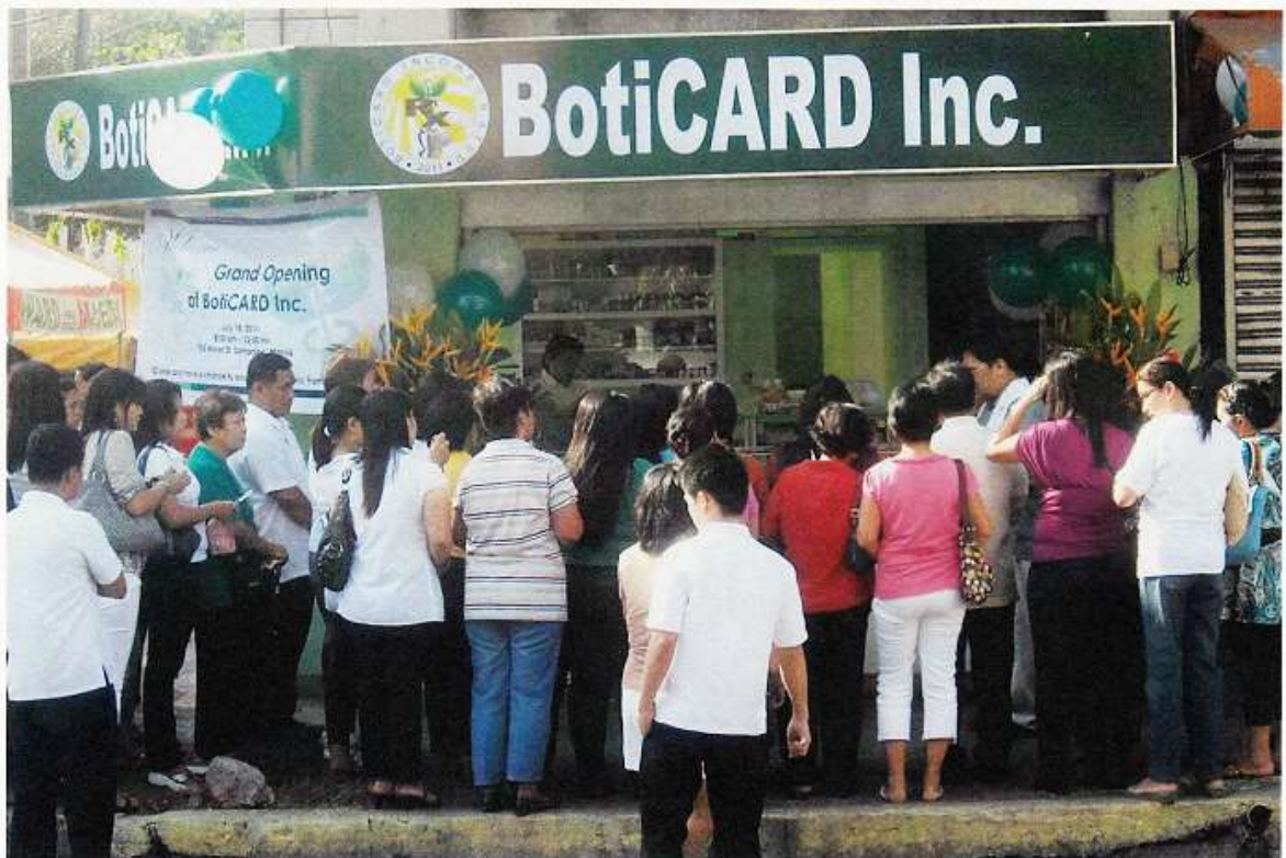
CARD Members attend the blessing of the BotiCARD Inc.

service establishments near CARD MRI offices in the Philippines. There are currently 12 CARD MRI clinics and 710 health service providers in the expanding CARD MRI health service network in the whole country. These health service providers form part of the CARD Healthy Pinoy Program also known as Microfinance and Health Protection Program that was initiated about five years ago with Freedom From Hunger, an international NGO also dedicated to fighting hunger and malnutrition essentially through women empowerment. The health program also covers health insurance through PhilHealth KASAPI and health education of CARD MRI members.