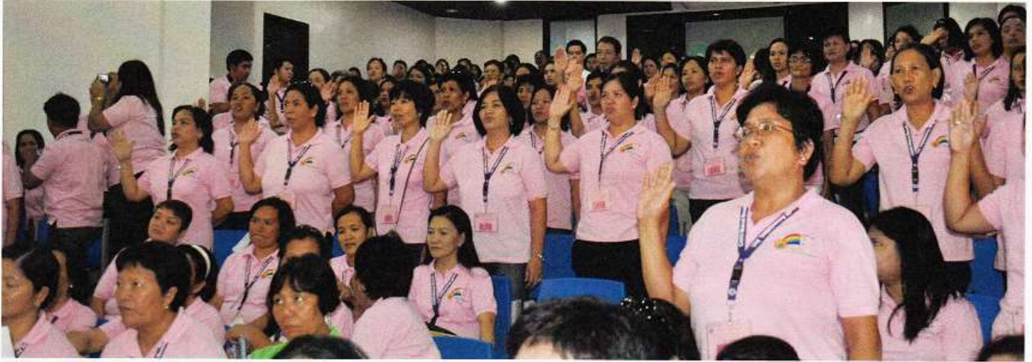
“CARD MBA new officers and representatives took their oath during the back-to-back Annual General Membership Meeting and Insurance Day on September 8-9, 2011.”

The meeting comes a day before the annual celebration of the birth of the association that was also designated by CARD MBA as Insurance Day reminding the members that protection from all possible risks through insurance is important to all people regardless of economic status. The number of persons insured by CARD MBA is 7.1M as of August 2011. September 9, 2011 marked the 12th year of CARD MBA.